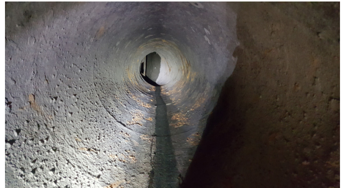
External view of 45° angled penstocks.

The Quadex Lining System® (QLS) spin-cast process, on the other hand, requires a much smaller footprint and features a highly-portable, custom designed application sled. Due to the ability of the GeoKrete material to be pumped fairly long