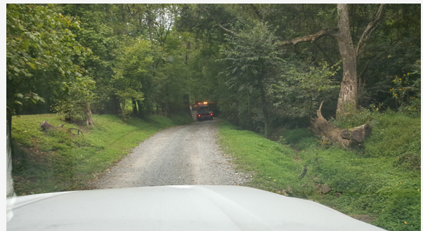
Remote access and narrow pathways.