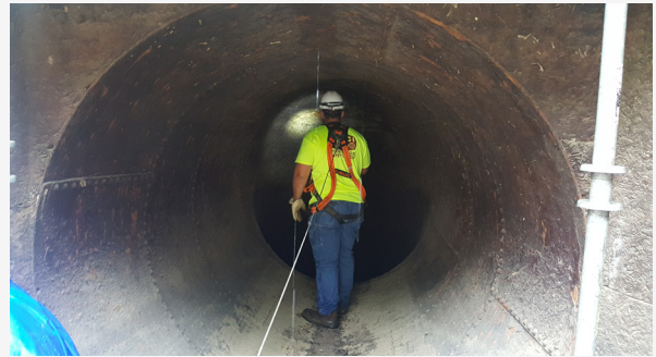
Peering down the steep slope of penstock.