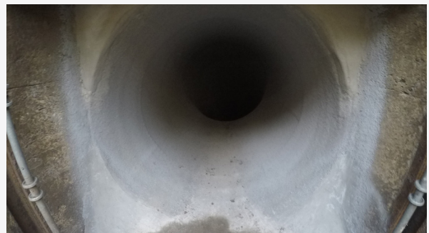
GeoKrete Liner - Structural renewal & restored flow capacity.